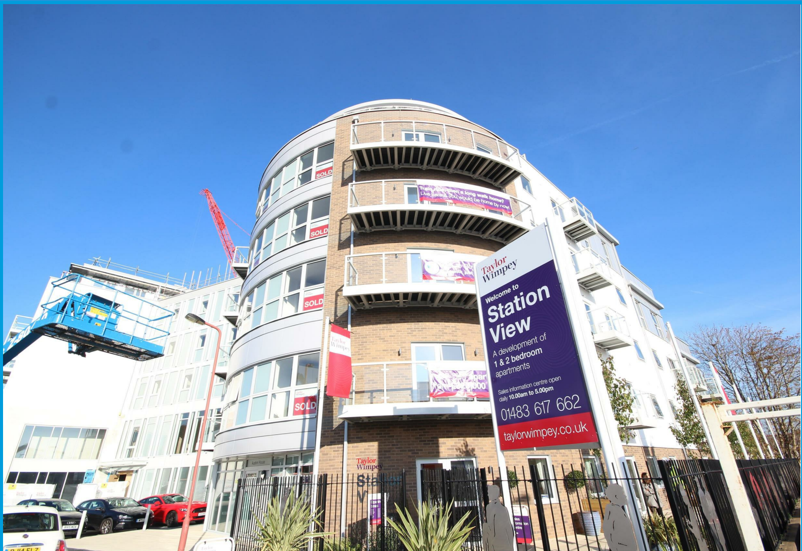
Austen House, Station View Guildford, Surrey GU1 4AX